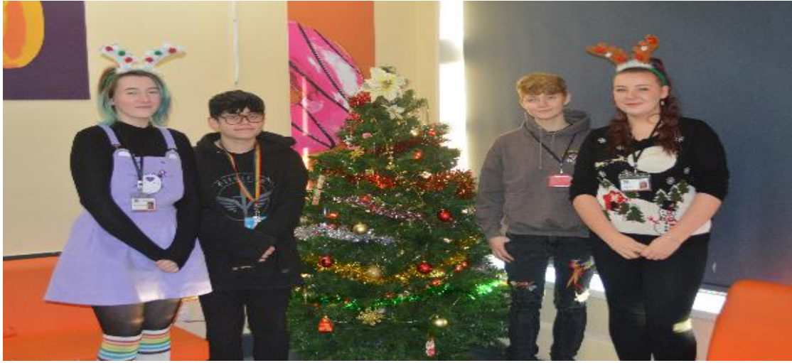
6 th form students with their tree

We will be ending the term with activities for our Year 7 including a form afternoon writing Christmas cards, thank you letters and poems, jokes, drawings for the elderly. On the last day we will allow Christmas jumpers (under blazers), Christmas hats or hair decorations in return for a can or packet to the foodbank charity brought to their Form Tutor the day before. Finally, all Forms will have a party together before going home on the last day.